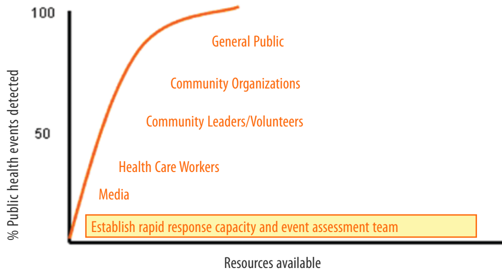
Fig. 3. Sensitivity of different reporting sources and level of resources required to maintain the event-based surveillance system